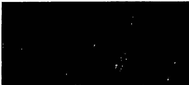
Westbound I-90 banner on Mercer Island, Bellevue police officer badge 99

[see full event list] [see past events too] [add an event]